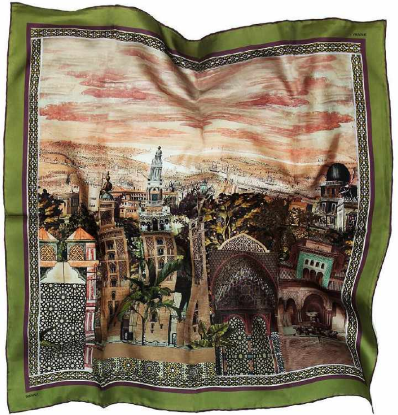
Silk route/ Andalucía - Scarf